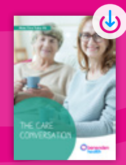
#2 How to approach the care conversation